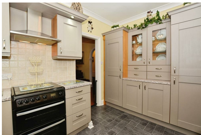
Breakfast Kitchen 7'10" x 12'1" (2.41 x 3.69)