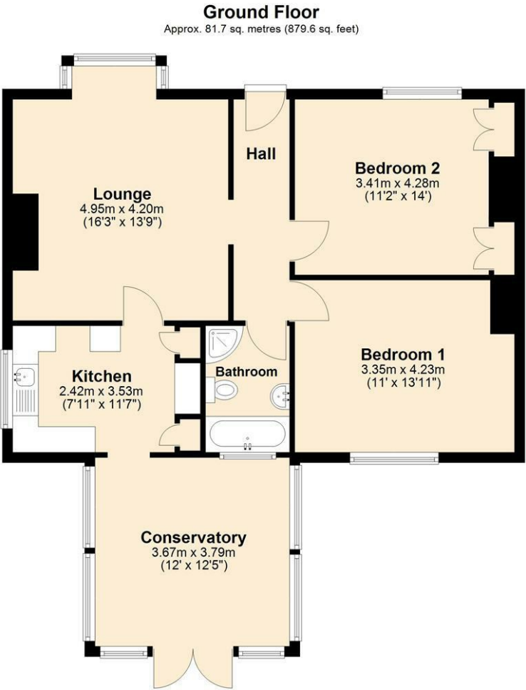
Total area: approx. 81.7 sq. metres (879.6 sq. feet)